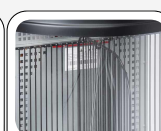
Inner divider included